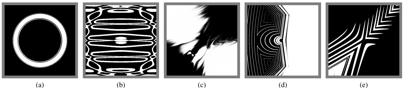
Figure 2: Selection of rare pictures. Each of these pictures discovered by novelty search was evaluated as rare by the observer because it has a combination of properties that rarely co-occur within the space of pictures.

these settings mutually conflict; generally an image is either compressible or not compressible, and incompressibility is more easily attained through wildly fluctuating pixel value (which would yield a higher average). It is also possible to learn about an encoding through observing rare artifacts: Figure 2c is rare because it is highly asymmetric along both the x and y axes and such rigidly rectangular asymmetry is not a natural bias of CPPNs (nor is it of DNA in nature).